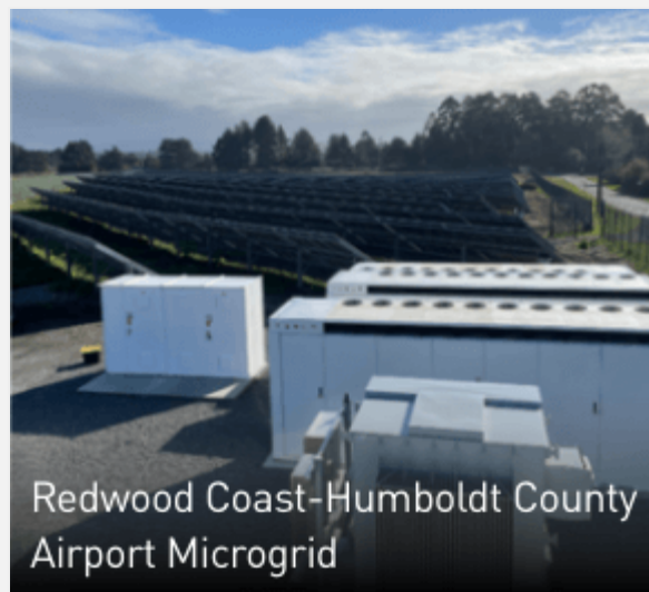
Redwood Coast-Humboldt County Airport Microgrid