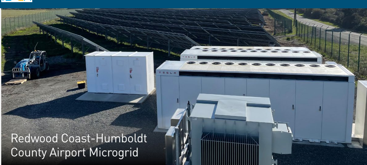
Redwood Coast-Humboldt County Airport Microgrid