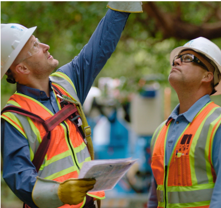
PG&E crews in the field

*Undetermined causes could be the result of hazards, such as a tree branch or animal, that were no longer present during patrols