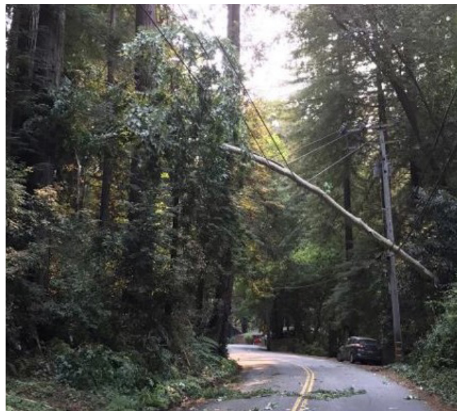
Example of a vegetation hazard that resulted in an EPSS outage last month

There were two EPSS outages in Tehama County this past month, which could have resulted in fire ignition without the enhanced settings in place.