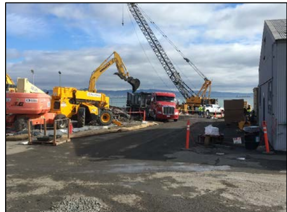
Loading debris and soil for transport and disposal

If you need additional information, please contact the PG&E toll-free response line at (866) 247-0581 or remediation@pge.com (calls returned the same or next business day). Se habla español. www.pge.com/potrero .