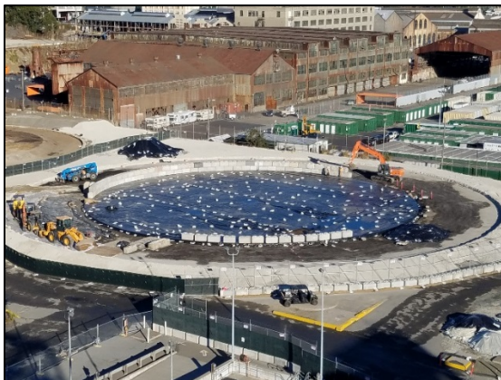
Constructed new soil stockpile area