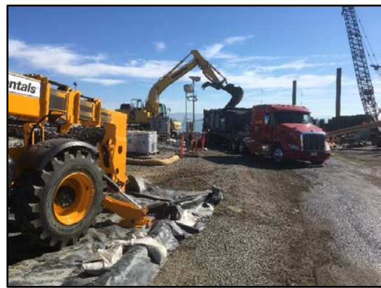
Loading material for transport and disposal

If you need additional information, please contact the PG&E toll-free response line at (866) 247-0581 or remediation@pge.com (calls returned the same or next business day). Se habla español. www.pge.com/potrero .