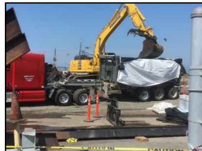
Loading soil for off-site disposal

If you need additional information, please contact the PG&E toll-free response line at (866) 247-0581 or remediation@pge.com (calls returned the same or next business day). Se habla español. www.pge.com/potrero .