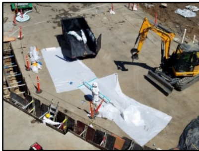
Removal of underground utility line no longer in use