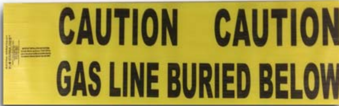
Figure 1 Gas Pipeline Underground Warning Tape