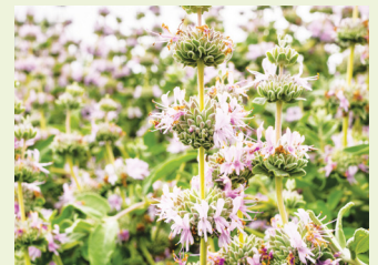
Purple Sage ( Salvia leucophylla and cvs.)