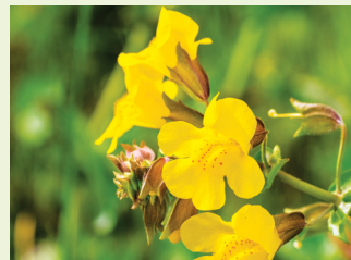
Monkey Flower ( Mimulus )