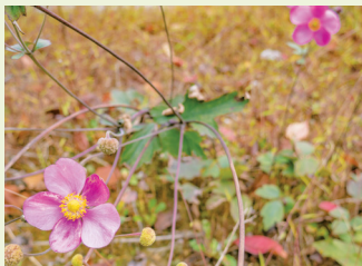
California Wild Rose ( Rosa californica )