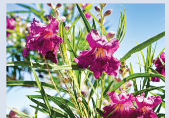
Desert Willow ( Chilopsis linearis )

This list includes recommended plant species for most California climate zones and is not all-inclusive. Consult your local nursery for more information. If there is an overhead or underground powerline on or near your property, there may be additional safe planting guidelines.