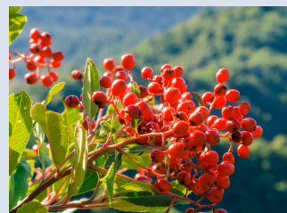
Toyon ( Heteromeles arbutifolia )