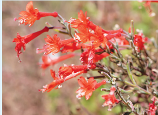
California Fuchsia ( Epilobium canum )