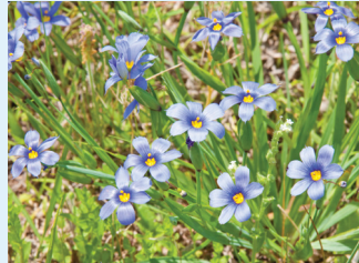
Blue-Eyed Grass ( Sisyrinchium bellum and cvs.)