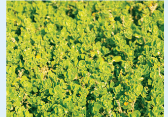
Yerba Buena ( Clinopodium douglasii )