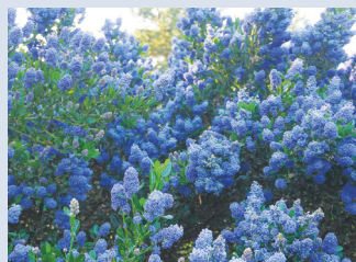
Blue Blossom ( Ceanothus thyrsiflorus )