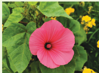
Tree Mallow ( Malva assurgentiflora )