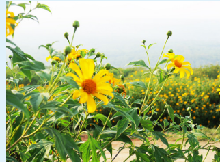
Coast Sunflower ( Encelia californica )