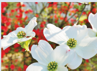
Flowering Dogwood ( Cornus florida )