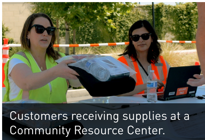
Customers receiving supplies at a Community Resource Center.