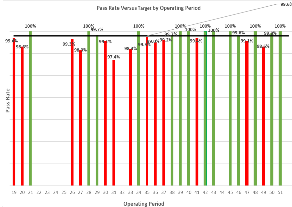
YTD QVVM Findings - EVM Work Verification Audit