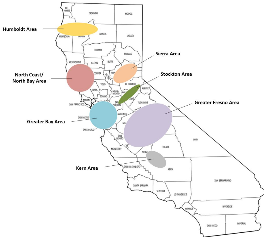
Figure I.2: PG&E Local Capacity Area (LCA) Map