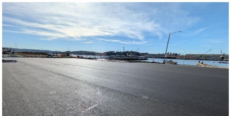
New paving in the boat launch parking lot area.