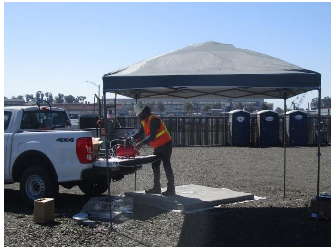
A worker collects soil vapor samples in fall 2024.

In late February/March 2025, PG&E crews will install and sample 10 groundwater monitoring wells to depths of 14 to 18 feet across the site (see Figure 2). Groundwater sampling will continue quarterly for the first year and then semiannually until DTSC determines no further groundwater monitoring is needed.