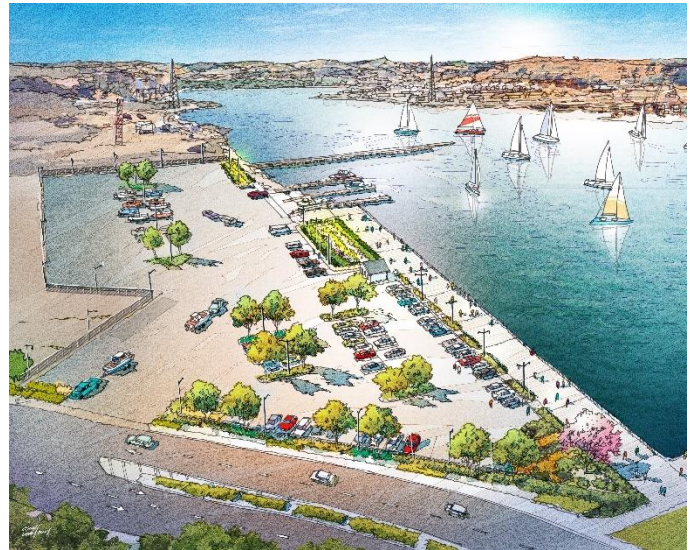
An artist rendering of the restored boat launch parking lot.

PG&E is returning to the site in February 2025 to conduct post-remediation sampling under DTSC oversight and then will complete the remaining boat launch parking lot restoration activities in accordance with permits from the San Francisco Bay Conservation and Development Commission (BCDC) and the City of Vallejo. This work supports preparing the site for future redevelopment by the City of Vallejo.