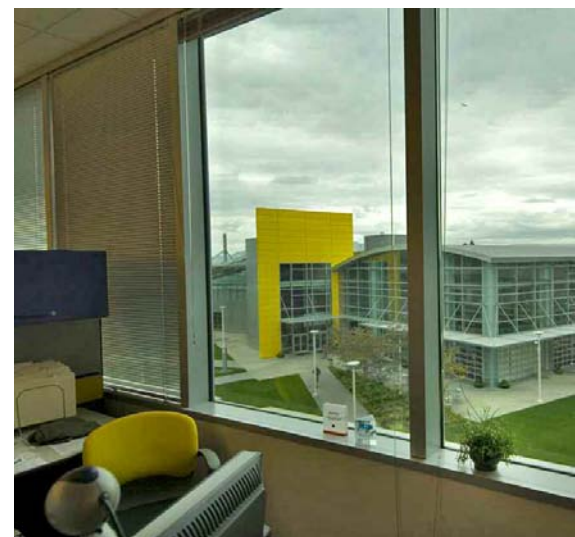
Office window after window film application

Managing Daily Peak Demand Campus electrical systems are controlled by a direct digital control (DDC) system, installed in 2001, that continuously monitors electric demand. The control program has three levels of load