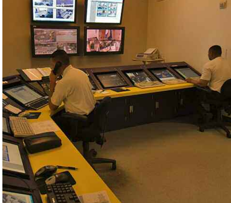
Building systems control room

In a project completed in mid 2006, Yahoo! installed nearly 130,000 square feet of window film. Across the six treated buildings the project is estimated to save at least 1.4 million kWh per year. Temperatures may be reduced by 2°F to 4°F in most affected areas, not only increasing employees' comfort but also enabling the facilities team to change temperature set points around the buildings, obtaining the maximum benefits of the project through an iterative process of adjusting environmental systems.