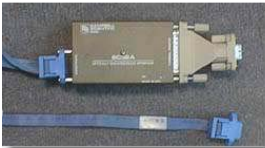
Figure 6: Optically Isolated RS232 Interface Cable

Graph Term is a DOS application that allows a computer to communicate with the logger. It can be used to upload the Edlog programs into the Campbell datalogger and to view real-time data. To view real time data using the number pad and the LCD display on the Campbell, enter * 1 A. Then use the A and B keys to scroll forward or back between input locations.