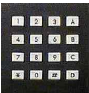
Figure 2: Campbell keypad

NOTE: If unit battery is left on for an extended period of time, battery failure is likely. To maintain battery life, keep unit charged (plugged in when not in use).