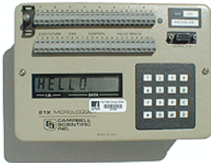
Figure 1: Campbell 21X

This application note introduces the programming of the Campbell Scientific 21X Datalogger. It is not intended to replace the user's manual, rather, it has been written to assist the user in using the Campbell while in the field and to familiarize the user with existing available software for writing Campbell programs. Sample programs (annotated) are available for download. Campbell Scientific supplies a laminated card with the entire CR21x instruction set.