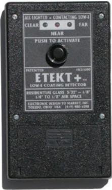
Figure 1: ETEKT+ LowE Detector.