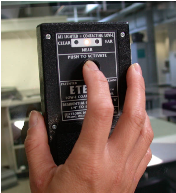
Figure 3: Meter shows LowE coating on the near side of glass.